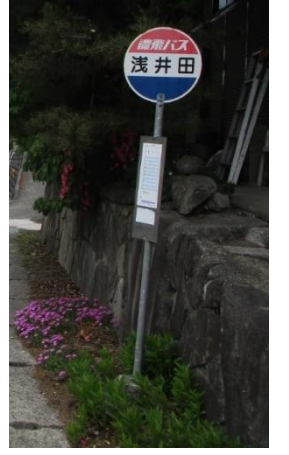
Nohi Bus Stop