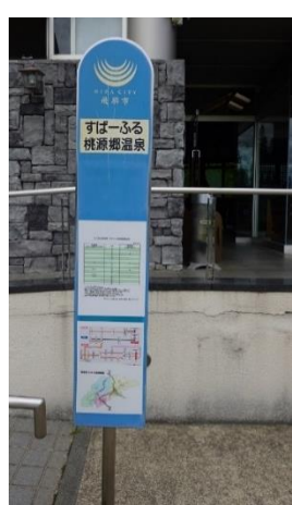
Hidamaru Bus Stop